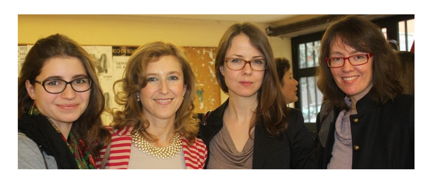
All photographs appearing in this booklet have been kindly provided by: